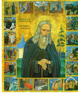
St Herman of Alaska