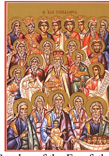
Sunday of the Forefathers