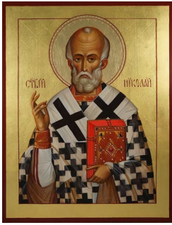
St Nicholas of Myra