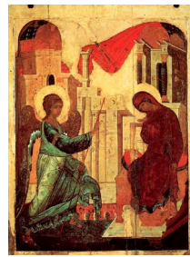
Annunciation of the Theotokos