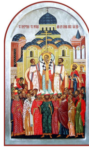
Veneration of the Cross