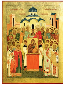
Sunday of Orthodoxy