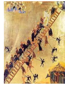
Ladder of Divine Ascent