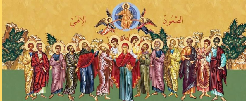
Feast of the Ascension of the Lord