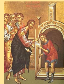
Healing of the Blind Man