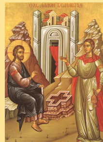
The Samaritan Woman