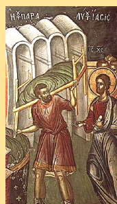
Healing of the Paralytic