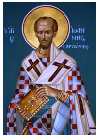
St John Chrysostom (11/13)