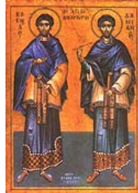
Holy Unmercenary Cosmas and Damian (11/1)