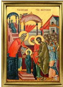
Entrance of Theotokos in the Temple (11/21)